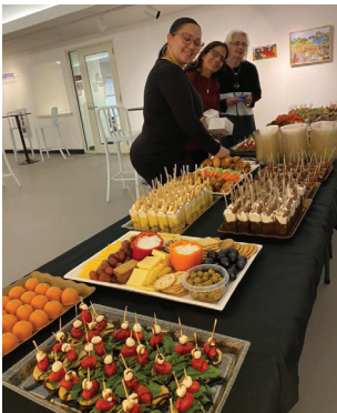
YWCA-GCR staff at our 7th Annual BraVa!