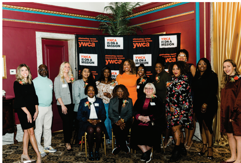
2022 Resourceful Woman Award honorees at Franklin Plaza.