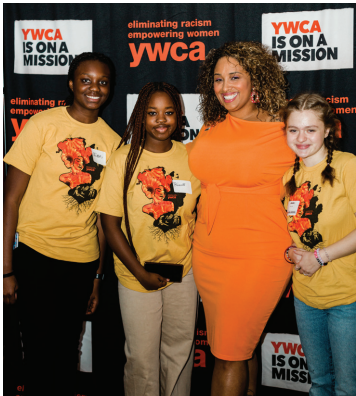
Students from Emma Willard School at the 23rd Annual Resourceful Women's Awards