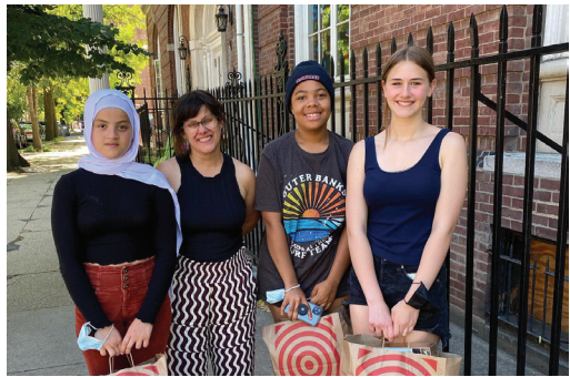
Students from the Robert C. Parker School donated toys for YWCA-GCR children.