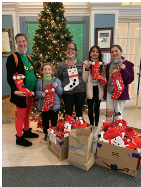
Students from Mater Christi School drop off stockings for Adopt-a-Family