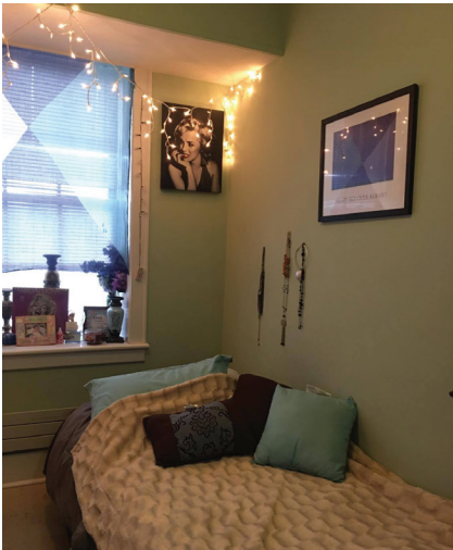
One of the 76 single-room occupancy (SRO) rooms at 21 First St.

SINGLE ROOM OCCUPANCY (SRO), our on-site, 76-unit permanent supportive housing program is safe, affordable and the most effective method to address homelessness and meet the diverse needs of our residents. Communal living provides shared bathrooms, kitchens, laundry, and a lounge. YWCA-GCR Housing Coordinators and support staff are available to all residents around the clock for assistance at various levels. During 2022, 102 women resided in