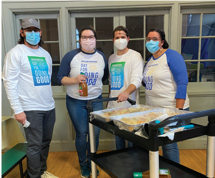
Employees from Regeneron Pharmaceuticals served up a delicious community meal in October 2022 for their Days for Doing Good volunteerism campaign.